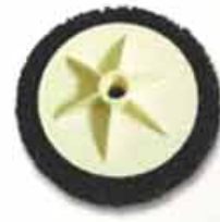
AC-BT22748 Stripping Wheel