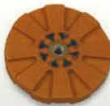
AC-26036-7 Rubber Eraser