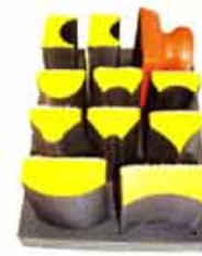
Sanding Kit Hand-held