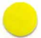
AC-BT1650-03Y 3" Coarse Yellow Polishing Pad