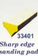
Sharp edge sanding pad