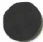
AC-BT1650-03G 3" Fine Gray Polishing Pad