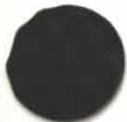
AC-BT1650-05G 5" Fine Gray Polishing Pad