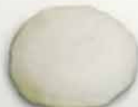
AC-BT1650-05W 5" Wool Wheel