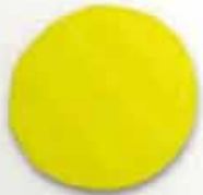
AC-BT1650-05Y 5" Coarse Yellow Polishing Pad