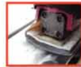
Sponge pad for fine abrasive