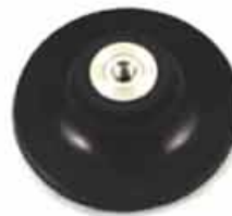
AC-210K-9 3" Roloc Pad