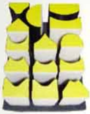
Sanding Pad Kit