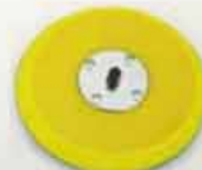
AC-BTOB-38-5V0 5" Pad (Hook-up)